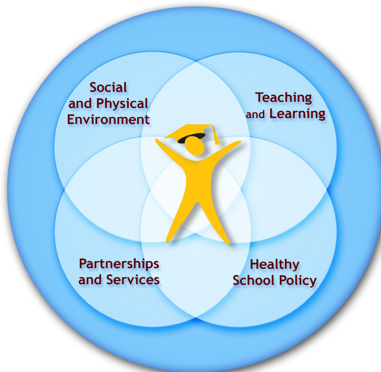
Figure 1: Comprehensive School Health Framework – Joint Consortium for School Health

The following sections provide an overview of promising approaches cited in the literature that may be applied in the school context to promote positive mental health outcomes among children and youth. The highlighted perspectives and practices are organized according to the major pillars of the comprehensive school health framework.